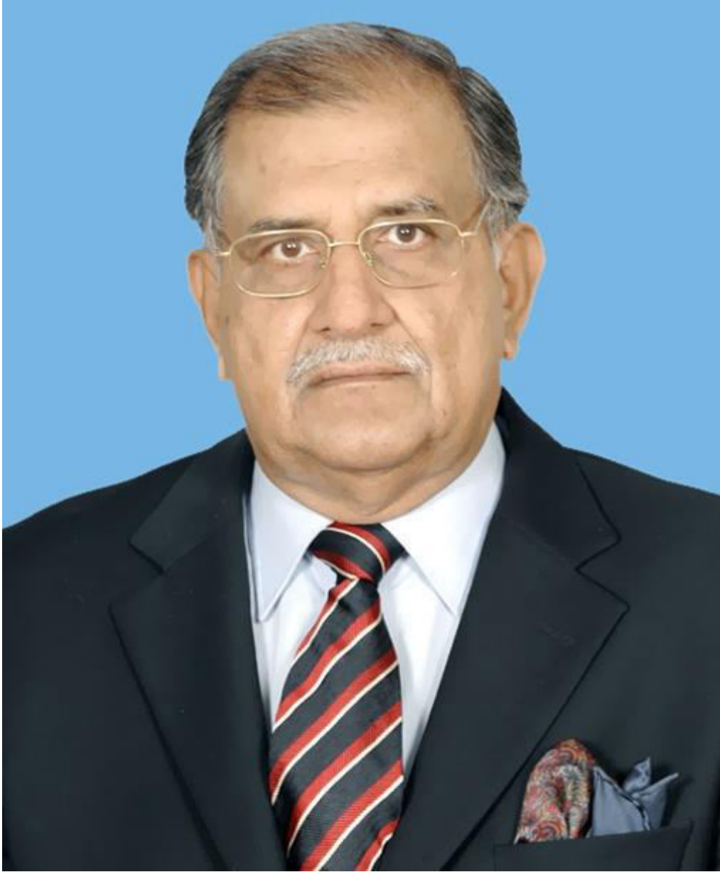
MIAN RIAZ HUSAIN PIRZADA Federal Minister for Inter Provincial Coordination