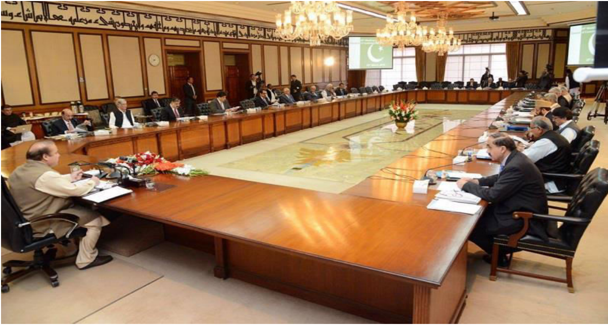
Prime Minister Mian Muhammad Nawaz Sharif addressing the 29 th meeting of CCI at P.M. Office on March 25, 2016