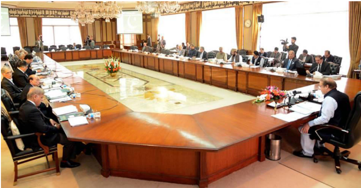
PRIME MINISTER MUHAMMAD NAWAZ SHARIF CHAIRING 28TH MEETING OF COUNCIL OF COMMON INTEREST (CCI) AT PM OFFICE ON 29TH FEBRUARY 2016.