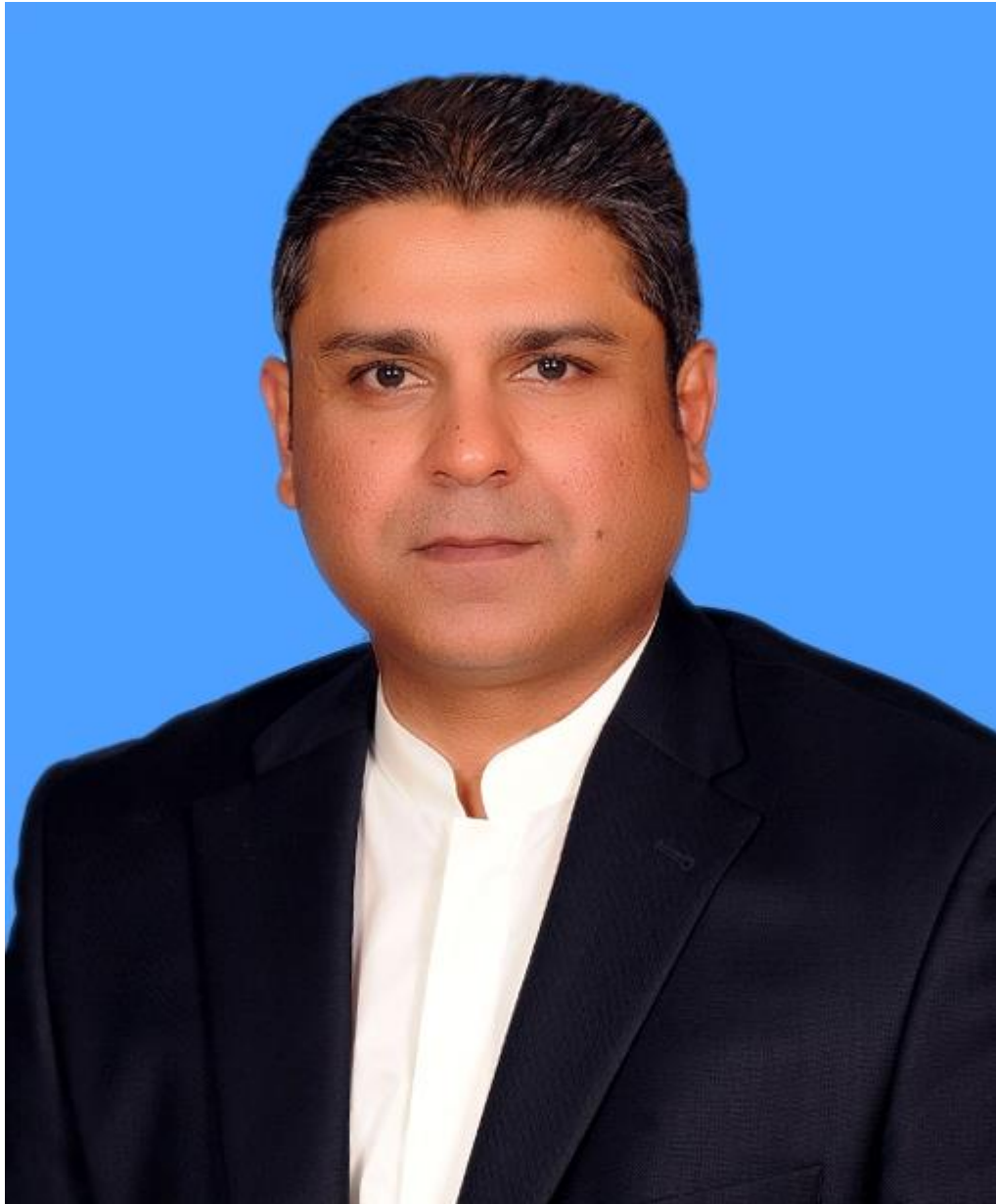
EHSAN UR REHMAN MAZARI FEDERAL MINISTER FOR INTER PROVINCIAL COORDINATION