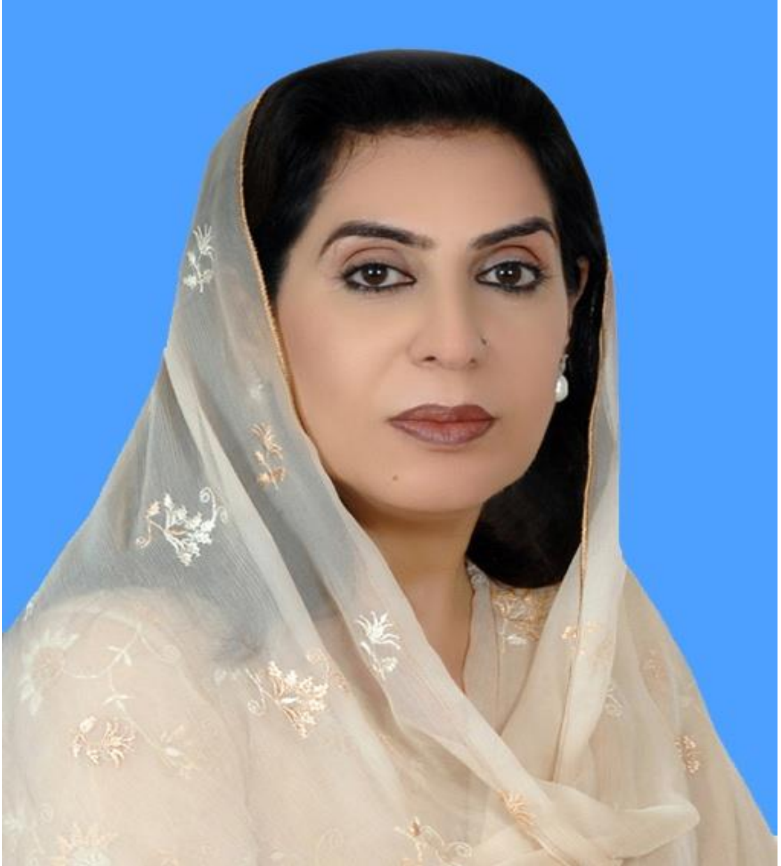
DR. FEHMIDA MIRZA FEDERAL MINISTER For Inter Provincial Coordination