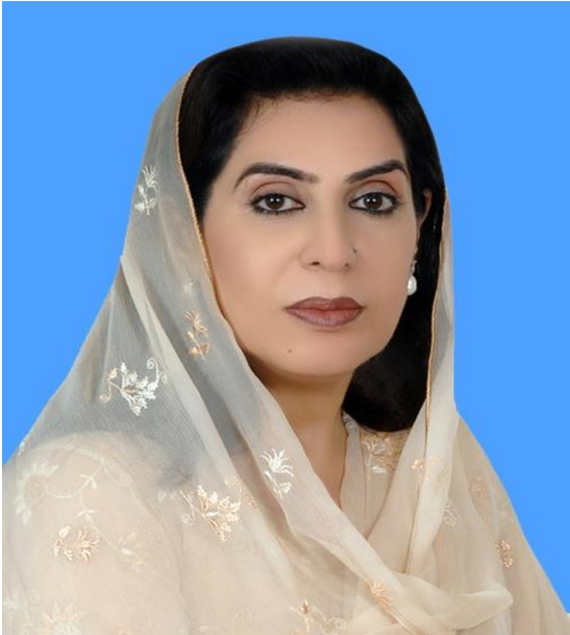
Dr Fehmida Mirza Federal Minister for Inter Provincial Coordination